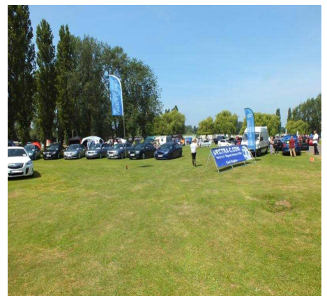
Stand Pictures from the weekends event 26 cars at times!