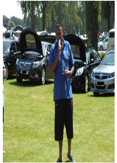
Saturday and Sunday Winners Signumboy and Happypostie